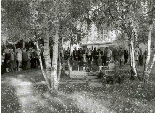
Attendees at the dedication

Among the many victims of the September 11, 2001 attacks were two former SRI employees. They were honored at ceremonies held November 15, 2001 in the area between buildings P and 320. A grove of birch trees surrounding a teak bench with a bronze plaque was dedicated in their memories, and in the memory of all the victims of the attacks.