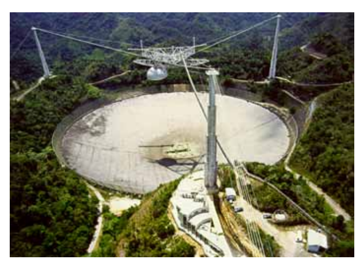
The Arecibo Observatory in Puerto Rico

SRI has been awarded a five-year cooperative agreement by the National Science Foundation (NSF) to manage, operate, and maintain the Arecibo Observatory in Puerto Rico. The award, valued at approximately $42 million, climaxes a multiyear effort to bring Arecibo into SRI's portfolio. The SRI team won the competition over Cornell University, which built Arecibo in the 1960s and has operated it ever since.