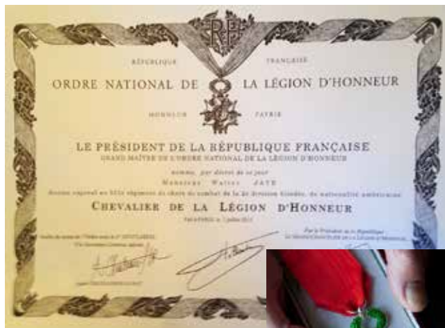
Official award certificate